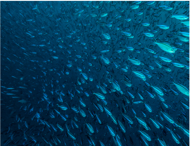
We work together with the Marine Management Organisation to monitor the detection of illegal, unregulated and unreported fishing.