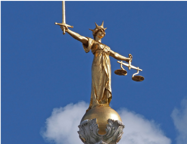
Working with her Majesty's Courts and Tribunals Service, CGI launched a new digital service to improve the juror summoning process in England and Wales.