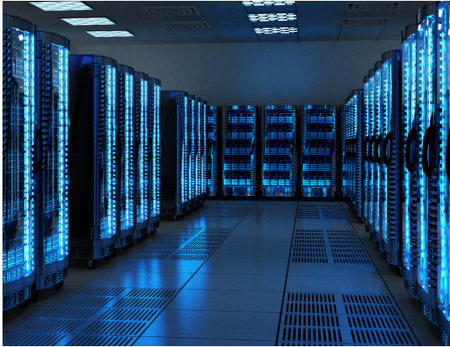
Thanks to our remote monitoring, Adept Power Solutions can now rapidly alert suppliers and customers when one of their standby power solutions has an issue.