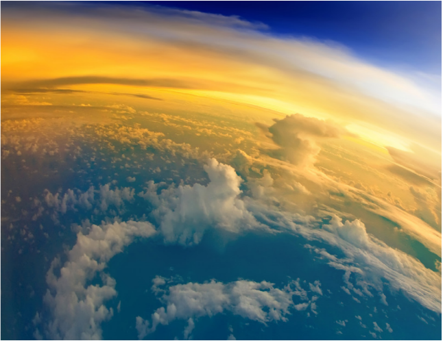
We partner with Defra to help them exploit Earth Observation data and prepare for future challenges.