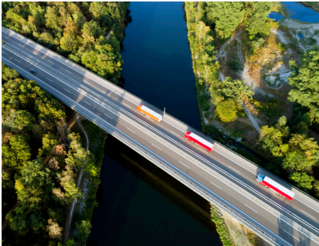
We deliver an end-to-end fuel payments system that enables Shell's customers to manage their commercial fleets across the world.