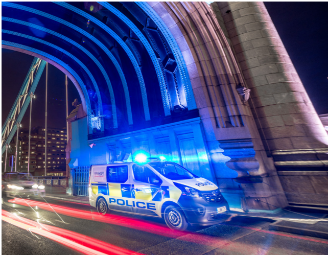
We support intelligence-led policing that better meets the challenges of 21st century crime.